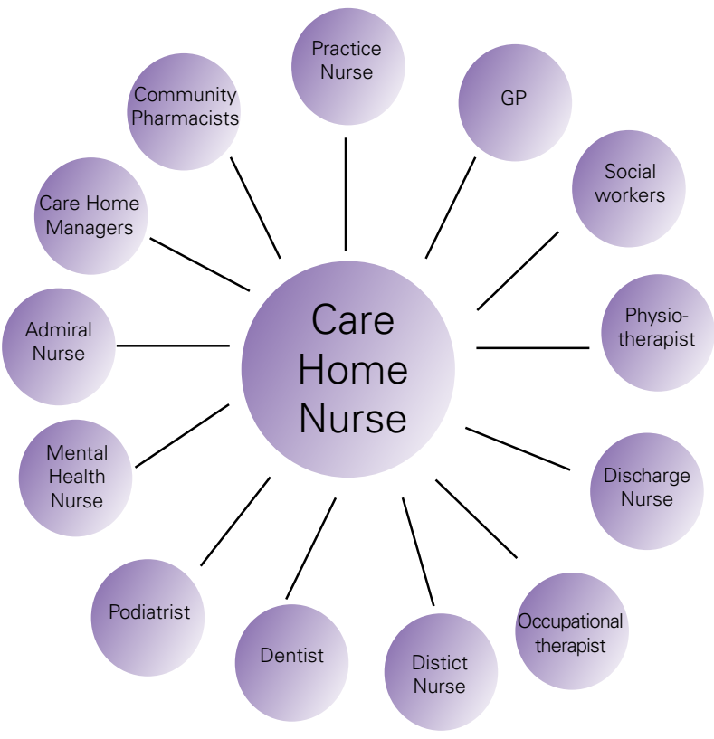
Figure 1.2 – Some key professional links for the nurse working in the care home setting

Although some key links are listed in figure 1.2, it is still useful to have a broad understanding of other community healthcare roles, which may have relevance to your practice, depending on the age, demographic profile and needs of your residents.