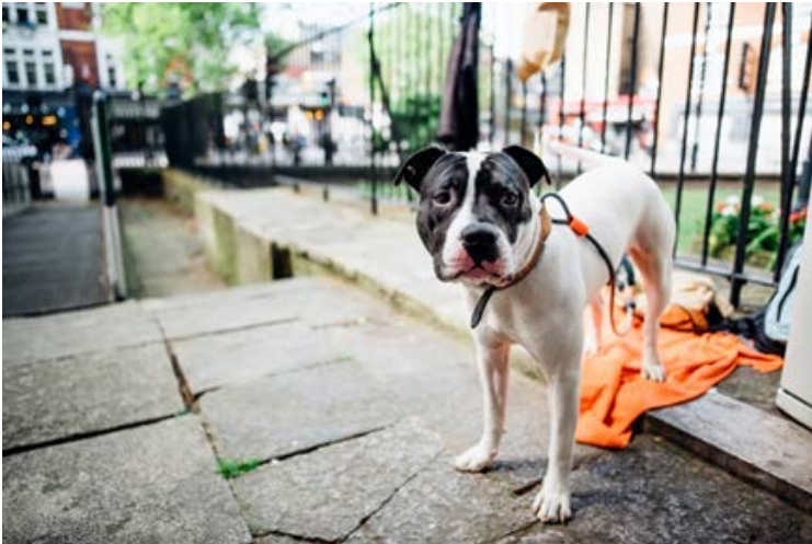
A homeless person's companion

A dog is often a homeless person's only companion, but the added expense of vet and food bills puts an extra burden on people who are already in a vulnerable situation. Our Animal Welfare Officers offer all homeless dog owners free general health checks and microchipping and provide light-up safety collars with tags and leads, jackets for the dogs in the winter months, dog food, treats and poo bags. Not only do we supply vital items for the animal, we are also there to support and advise the owner too. However difficult the situation may be, we never judge and we are always available to help. We encourage and offer their dogs free neutering, vaccinations and a general health check with a Mayhew Vet at our on-site Community Vet Clinic in Kensal Green.