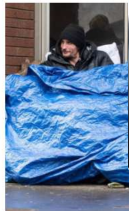
Beggars are flocking to Royal Leamington Spa where some rough sleepers earn £200 a day